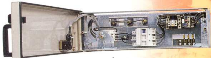
S3 drawer with thermographic test option

Drawers have hinged front panels with a power cut-out / control handle and control / display auxiliaries.